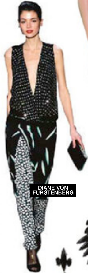
DIANE VON FURSTENBERG